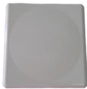
RFAnt-50DP-23 23 dBi directional panel antenna