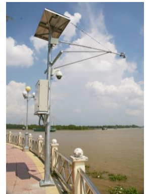
River Monitoring with sensor