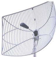
RFAnt-50GP-31 31 dBi grid parabolic antenna